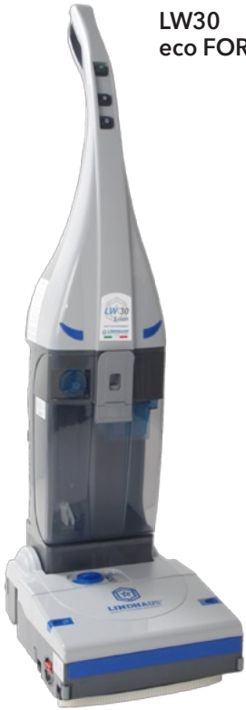
LW30 eco FORCE