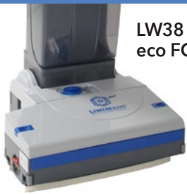
LW38 eco FORCE