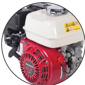
Honda GX160 Engine

A world leading Interpump direct drive pump powered by an ultra reliable Honda petrol engine ensures the Cobra has a long & trouble free life.