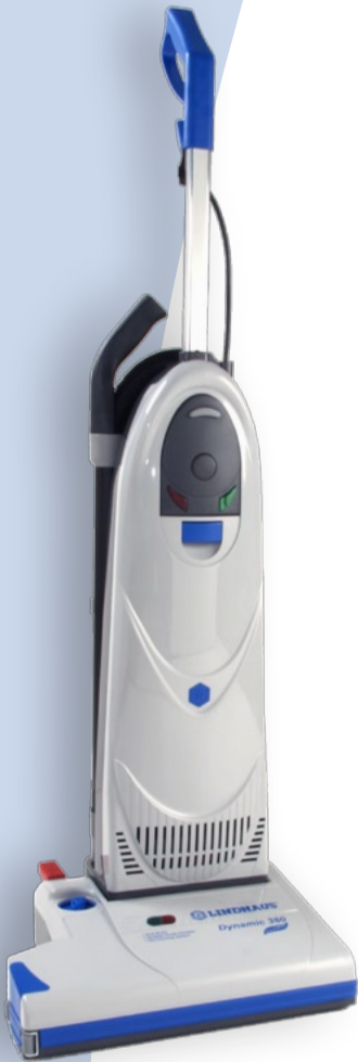
DYNAMIC eF 380e