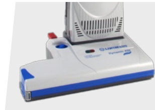
DYNAMIC eF 450e