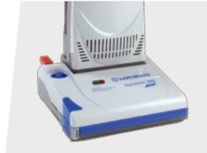
DYNAMIC eF 300e