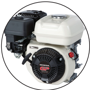
Honda GP160 Engine

A world leading Interpump direct drive pump powered by a Honda GP petrol engine ensures the GP Series has a long & trouble free life.